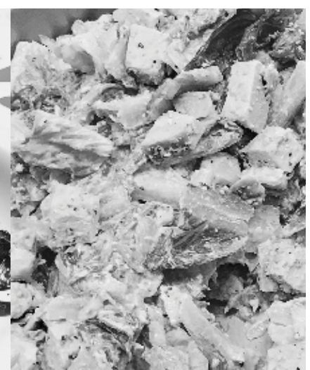
Healthy/Vegetarian Options Z-6 & East Commons

Visit westga.edu/dinewest for weekly menus for Z-6 and East Commons dining halls.