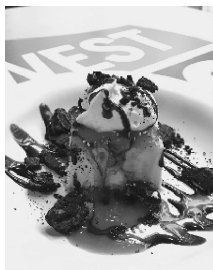
Cheesecake Bar Expo Station - Z-6

Take a break from boring with exciting new variety at Z-6 and East Commons!