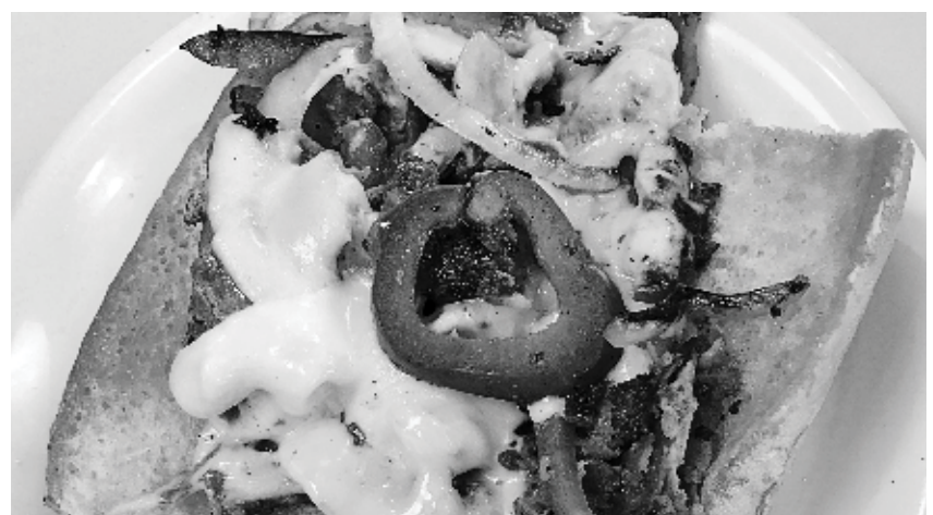
Philly Cheese Steak Thursdays Mongolian Grill - East Commons

Take a break from boring with exciting new variety at Z-6 and East Commons!