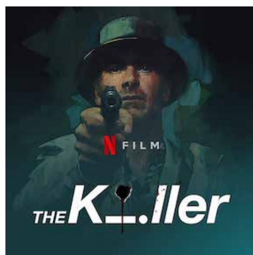
in conjunction with a well-known composer, heightens the tension and adds to the overall atmosphere of the movie. A lasting auditory experience is produced by the flawless symbiosis of sound and vision, even after the credits have rolled.

An essential component of any noir picture, the musical score enhances the images with a melancholic tune. The soundtrack, which was created