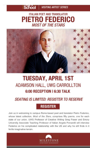
poem with care. His dedication to studying America and his exploration of persona poems provided a unique lens through which the audience could see the world and their own experiences. It prompted them to think more deeply about perspective, empathy and the power of adopting different voices in order to convey complex emotions.